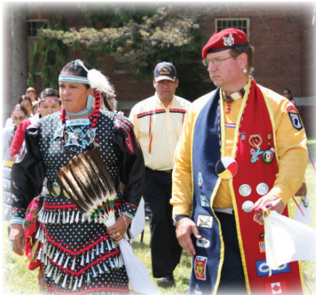
2014 Honoring, Healing & Remembering Commemoration at the Mt. Pleasant Indian Industrial Boarding School site